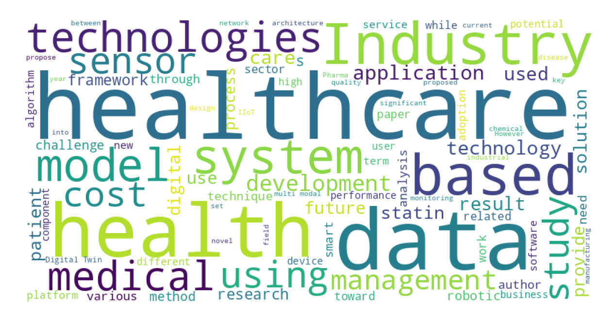
Figure 2. Word cloud from the study

The qualitative aspect of the analysis, based on a review of titles and abstracts, reveals a depth of exploration into various facets of Industry 4.0 in healthcare. For example, one study focuses on an IoT-based multi-sensor healthcare architecture, indicating a detailed examination of IoT applications in healthcare settings. Another study explores the use of digital technologies in reducing healthcare costs, demonstrating a practical application-oriented approach to Industry 4.0 technologies.<sup>8,9</sup>